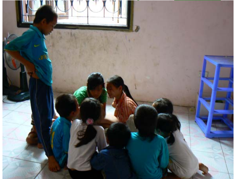
The kids of the Youth House have the opportunity to communicate with children from the other side of the planet.

http://www.youtube.com/watch?v=xqwolPwzQF8